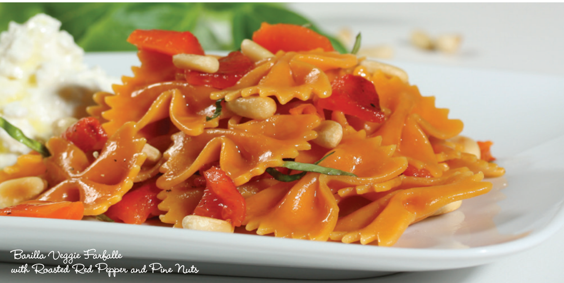
Barilla Veggie Farfalle with Roasted Red Pepper and Pine Nuts

Easy, Delicious, Nutritious Crowd-Pleasers for Time-Pressed Families